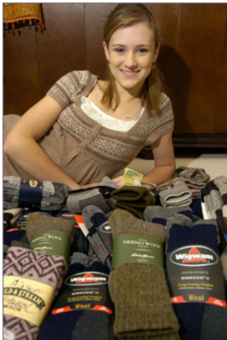
Enlarge

"When we first moved here, we only had enough fuel to run the generator for (four) hours a day, had no running water, and barely enough hygiene